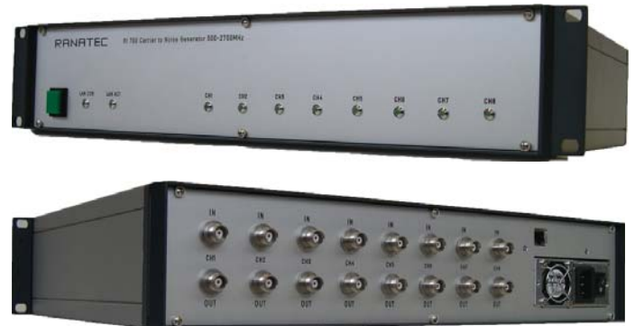
Ranatec RI 700 is a wideband Carrier-to-Noise Generator for remote controlled applications.

Each channel has a separate noise source which means that all channels are uncorrelated. Each channel has an internal combiner that is used to add the controlled noise to the user carrier. The SNR of the user carrier can then be controlled by adding a suitable amount of noise. By adding the SNR option, the carrier-to-noise ratio is accurately calibrated and monitored. The user has the possibility to enter C/N0 through the web interface.